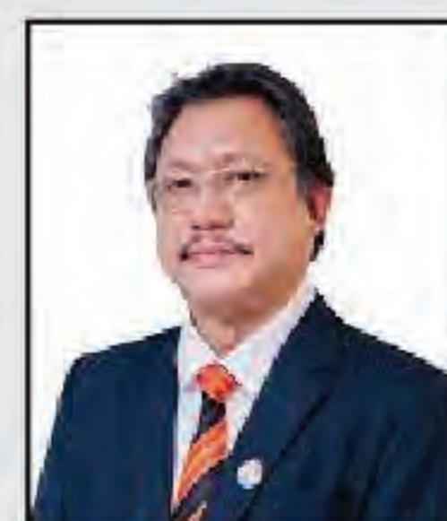
THE HONOURABLE DR. HAJI HAZLAND BIN ABANG HIPNI DEPUTY MINISTER OF ENERGY ENVIRONMENTAL SUSTAINABILITY